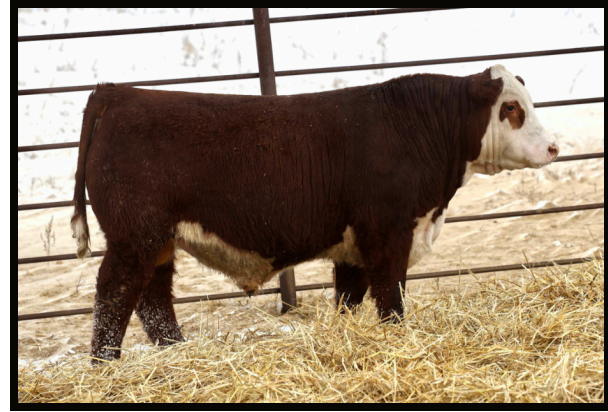
Lot 9: CCCC ENDURE 7401 339L ET

Top 1% for REA & CW Top 5% for YW, SCF, BMI, BII & CHB Top 10% for WW, MG & TEAT Top 25% for UDDR, SC, MM & MCW