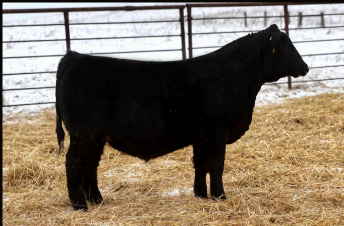
LOT 52: PAYROLL 210 320L