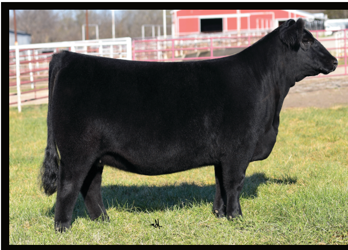
4WA MAYFLOWER 532 DAM OF LOTS 44-47 GRANDAM OF LOT 48