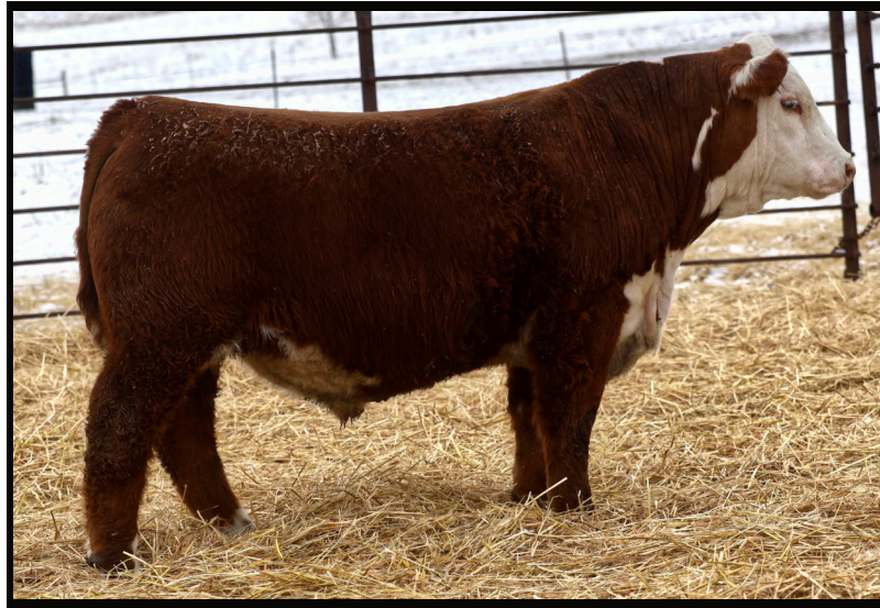
LOT 7: CCCC MAVERICK 11E 308L ET

The next two Mercedes sons are sired by one of the top young bulls in the breed, Maverick. Loaded with style & eye appeal, they offer strong growth & carcass with moderate calving ease.