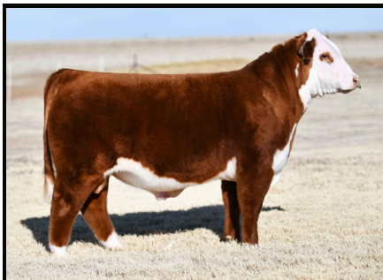
GREEN JCS MAKERS MARK 229G ET BROTHER TO LOTS 5-8

Top 2% for SCF, BMI & BI Top 4% for SC & TEAT Top 5% for CE, UDDR & CHB Top 8% for REA & DMI Top 10% for BW & MCE Top 15% for WW & MG Top 20% for YW