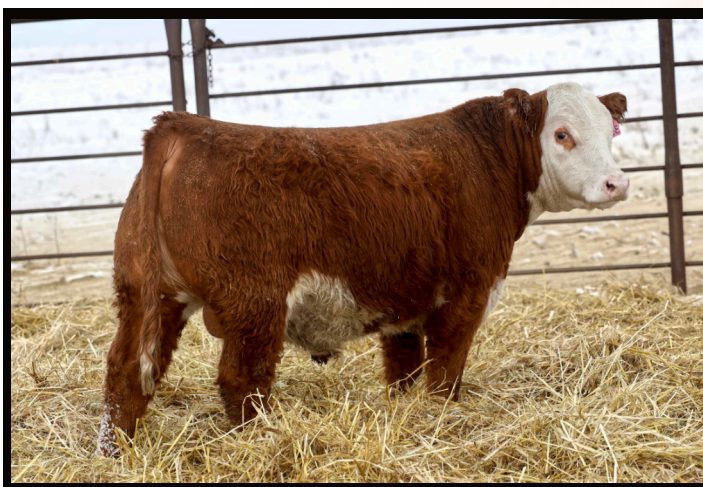
LOT 18: CCCC DECISIVE 570 358L