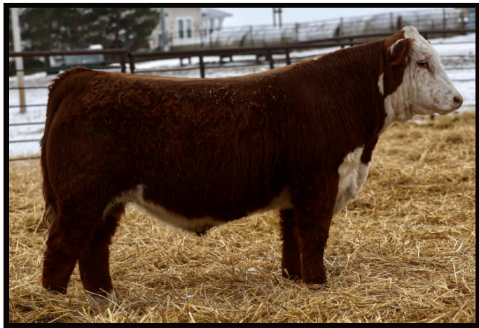
LOT 21: CCCC MAVERICK 50D 371L

Top 1% for REA & CW Top 10% for MG, CHB, BMI & BI Top 20% for WW, YW, SCF, MM & FAT