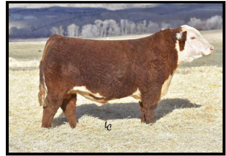
CHURCHILL STUD 3134A GRAND SIRE OF 319L - LOT 4