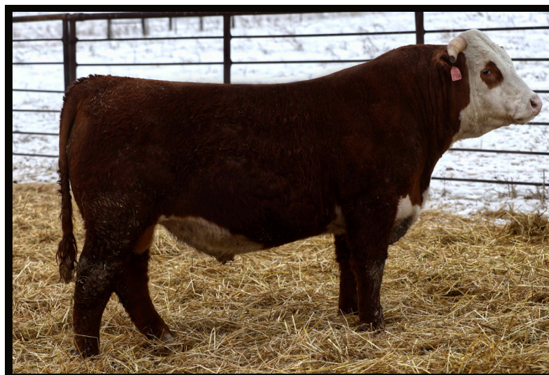
LOT 29: CCCC BANKROLL 836 274K

Top 1% for SC Top 2% for MM & MG Top 6% for YW Top 10% for TEAT & REA