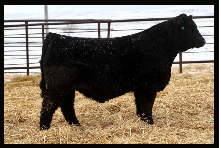
LOT 47: DIGNITY 532 6L ET