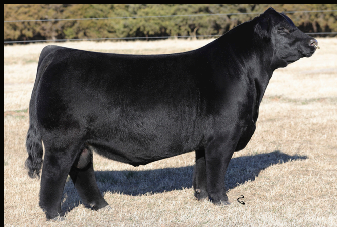
JSUL SOMETHING ABOUT MARY 8421 SIRE OF LOT 51

-Every year I always go to my dads place and find a few I just cant let him cut. -This bull is every bull buyers dream, picture doesn't do him justice, he's so opened up in the center portion of his body huge sweepy rib cage, with athletic ability to cover a lot of country. Add that perfect blaze face, how can you go wrong?