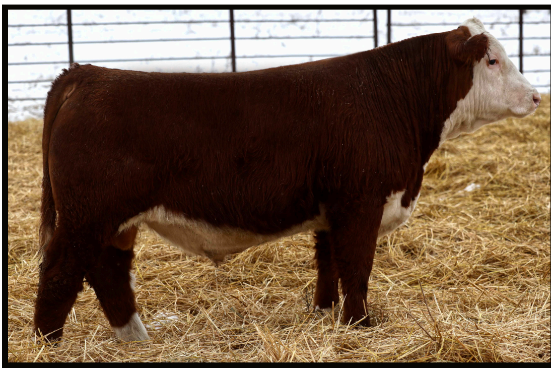
LOT 25: CCCC HIGH TIME 45C F29K ET

We have a limited number of fall bulls in the offering, but they are ready for heavy service. These first two full brothers have a big time EPD profile and out of our elite donor cow, 45C. These two brothers may have the most prolific set of EPD in the offering. They offer elite growth & carcass. Couple that with their great maternal pedigree and you will have two great maternal prospects.