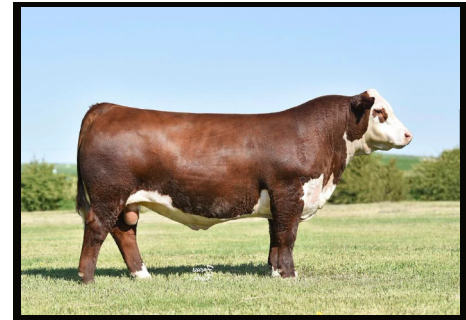
NJW 79Z Z311 ENDURE 173D ET SIRE OF MANY BULLS SELLING