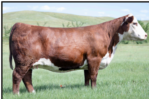
JDH AH MERCEDES 11E ET DAM OF LOTS 5-8

Top 7% for REA, CW & BMI Top 11% for CHB & BI Top 25% for YW, SCF & UDDR