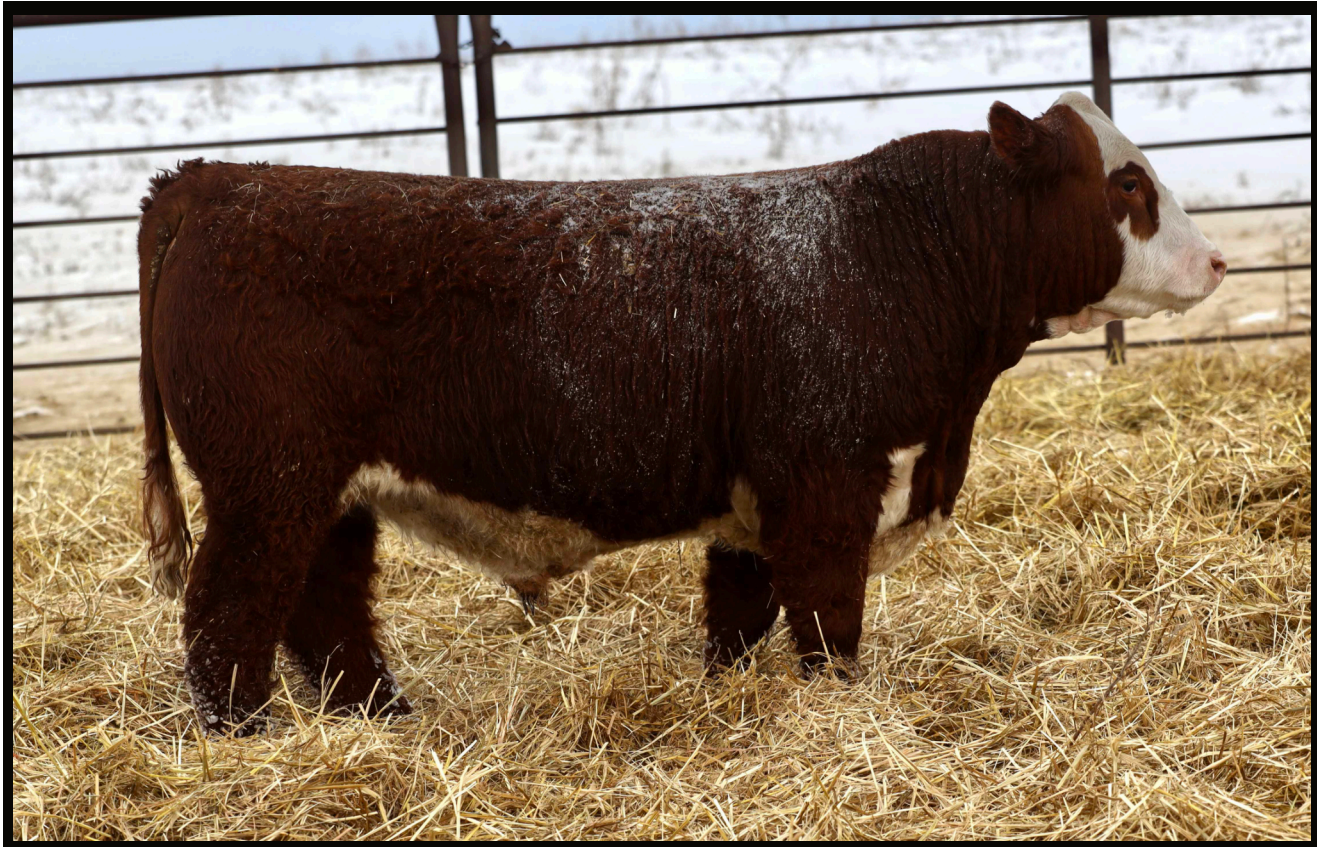
LOT 14: CCCC DECISIVE 37D 357L

Two full brothers out of our Rushmore donor cow. 357L is her natural calf. He's Homozygous Polled and well balanced for his numbers.