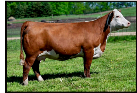
JDH AH MS 34X VICTOR 33Z 45C ET DAM OF LOTS 1-4, 25&26, 34&35