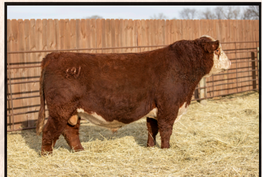
UPS DECISIVE ET SIRE OF MANY LOTS SELLING