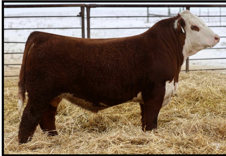
LOT 5: CCCC BLUEPRINT 11E 307L ET

5 & 6 are two full brothers out of the breed changing Mercedes donor cow. They are both full brothers to the AI sire Makers Mark. Expect the calves out of these brothers to be very stylish and eye appealing, and they're both Homozygous Polled.