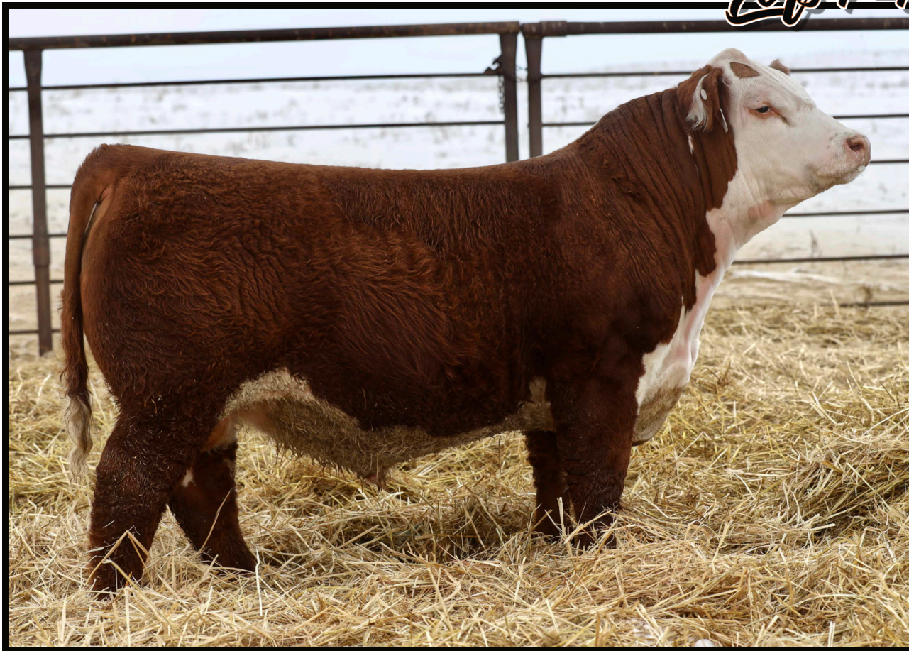
LOT 1: cccc ENDURE 45C 311L ET

These three full brothers are 45C sons and will sire outstanding daughters. 311L was part of our NWSS Pen of 3 Bulls and they are all Homozygous Polled. They offer the type and kind you can't find just anywhere.