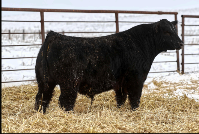
LOT 53: THE TIMES 16G 301L