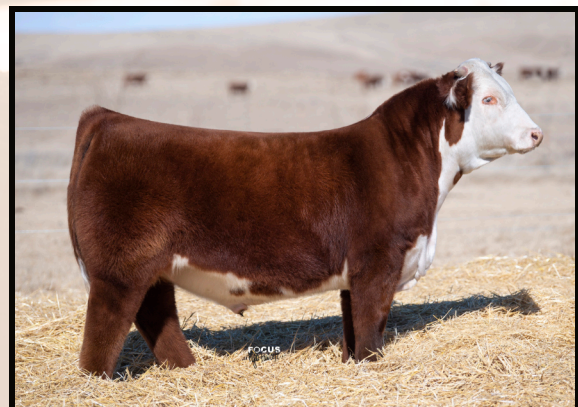
ECR COPPER CANDI 1333 ET MATERNAL BROTHER TO LOTS 30&31