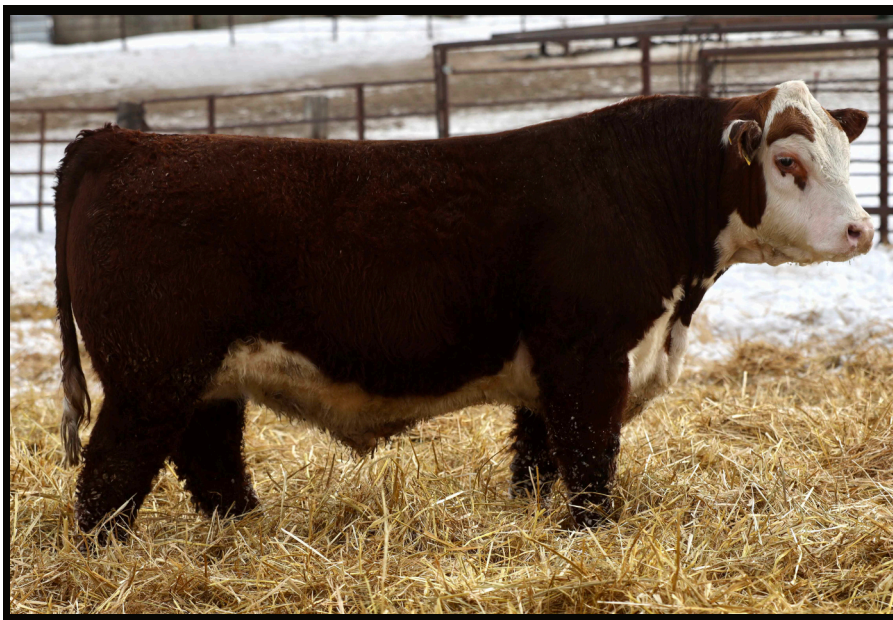
LOT 3: CCCC ENDURE 45C 314L ET