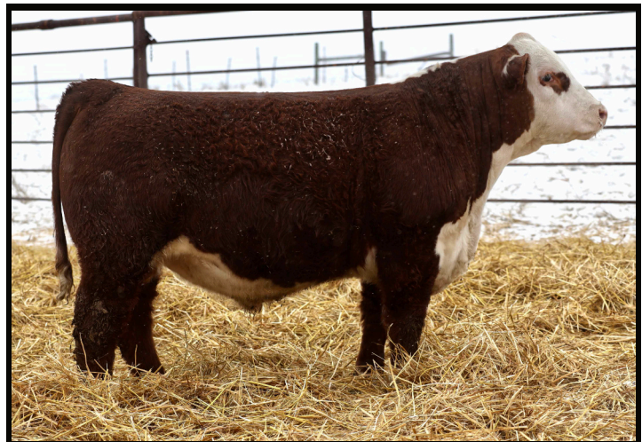
LOT 6: CCCC BLUEPRINT 11E 309L ET