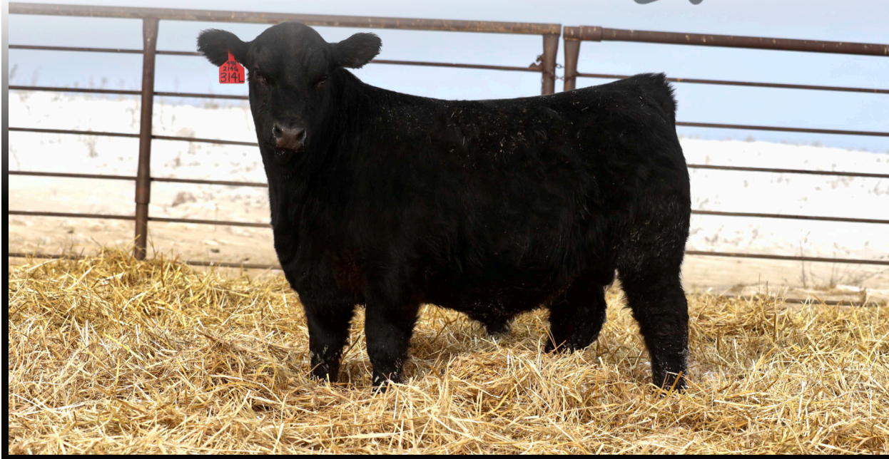
LOT 49: VEGAS 214G 314L