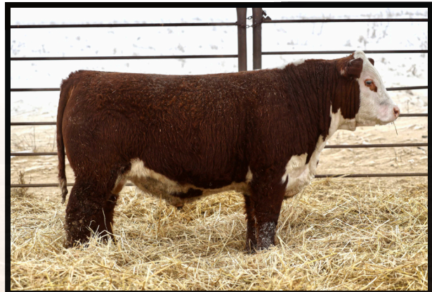
Lot 11: CCCC ENDURE 7401 335L ET

Top 1% for CW Top 5% for YW & CHB Top 10% for WW & REA Top 25% for SC, MG, UDDR, BMI & BII