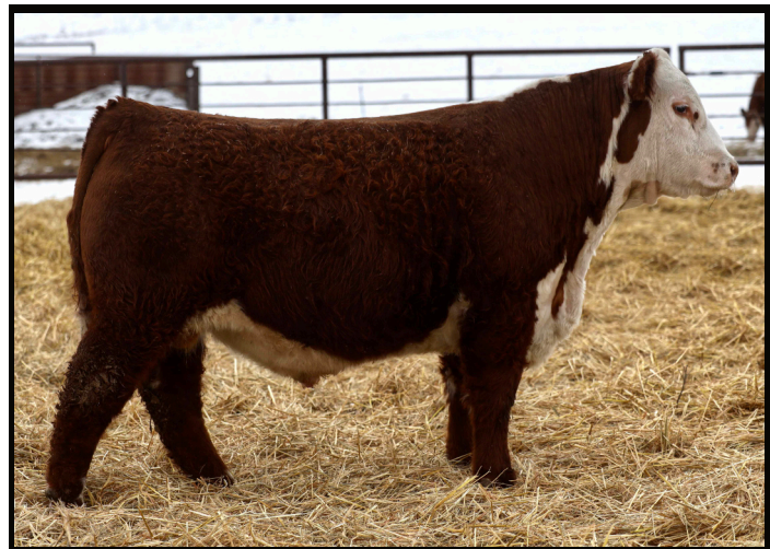
LOT 8: CCCC MAVERICK 11E 306L ET