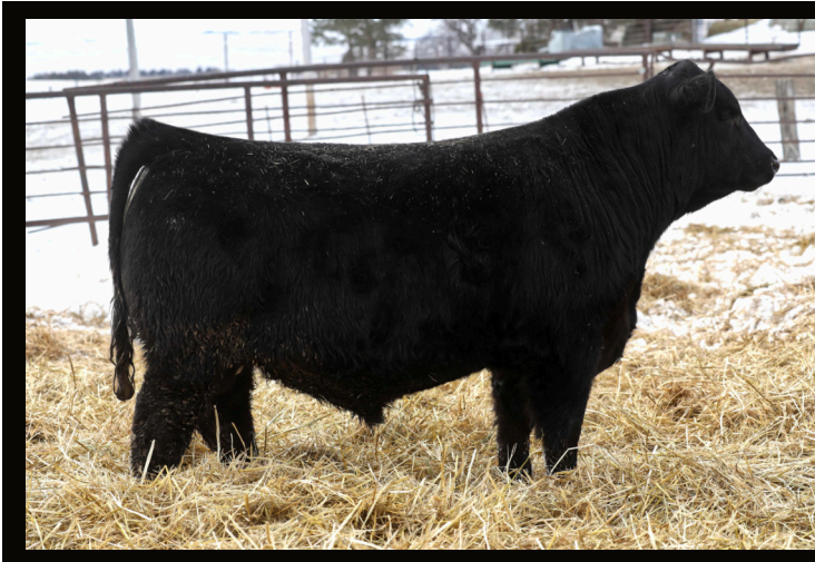
LOT 46: DIGNITY 532 77L ET