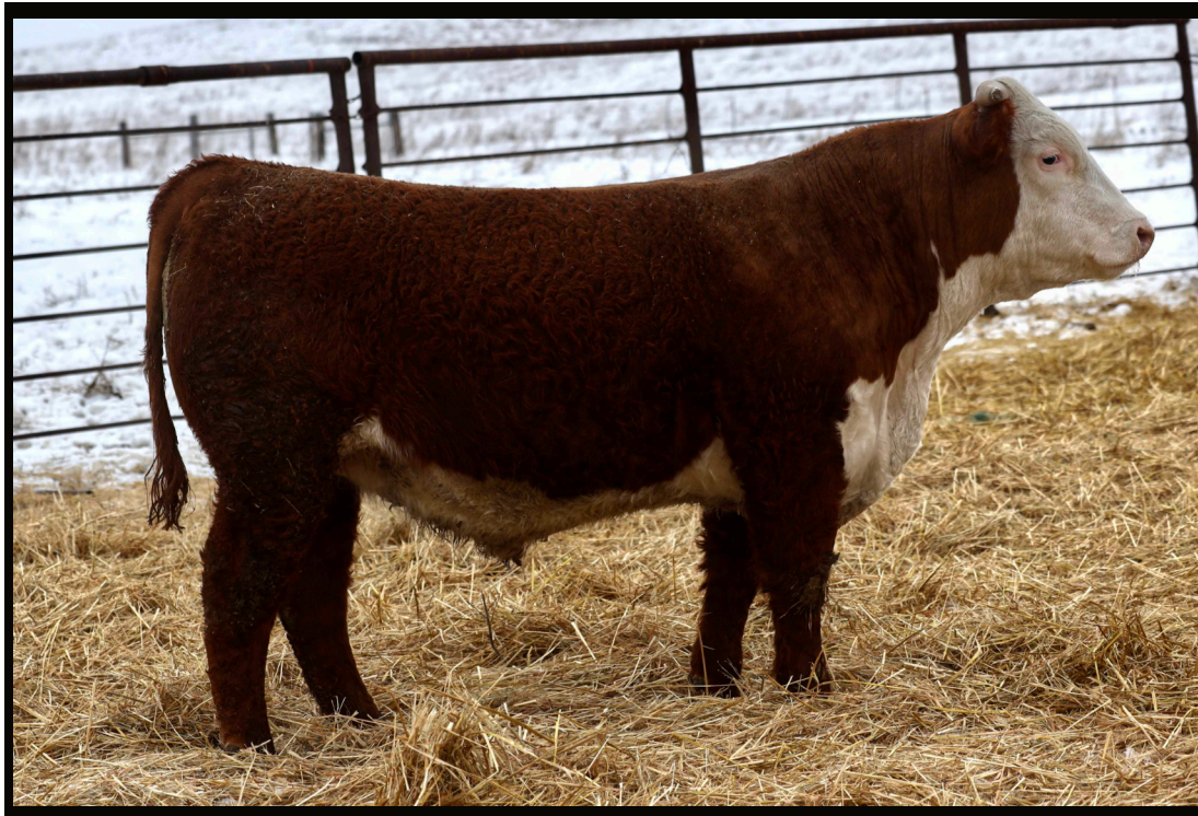
LOT 31: CCCC LOGIC CANDI 275K ET

30 & 31 are two full brothers out of a top 2296 daughter that Efflings showed. These Logic sons are both maternal sibs to the $48,500 Copper Candi bull that resides here at the ranch and is seeing heavy use, they will sire calves that have a lot of eye appeal and dimension. One horned & one polled, pick your poison.