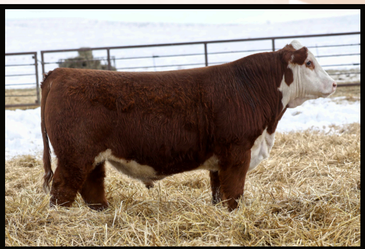
LOT 19: CCCC DECISIVE 5474 356L