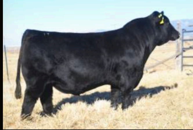
THSF LOVER BOY B33 SIRE OF LOT 54