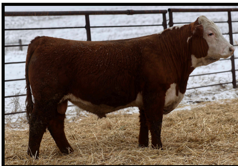
LOT 28: CCCC GENESIS 4295 286K ET

Kicking off the 2 year old division in a big way! Lot 28 is a full brother to the top selling bull from the '23 Express sale, EXR Generator 0333 ET. Half interest in a full sister to this bull sold for $19,000 in our Fall Female Sale. Backed by one of the great donor cows in the breed today, you've got an excellent herd sire prospect that is ready for immediate turnout.