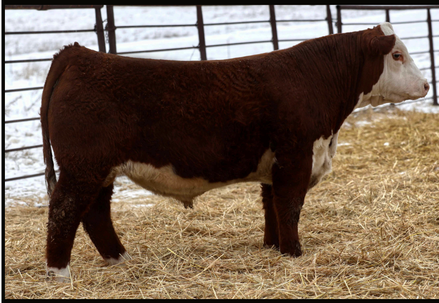
LOT 2: CCCC ENDURE 45C 313L ET