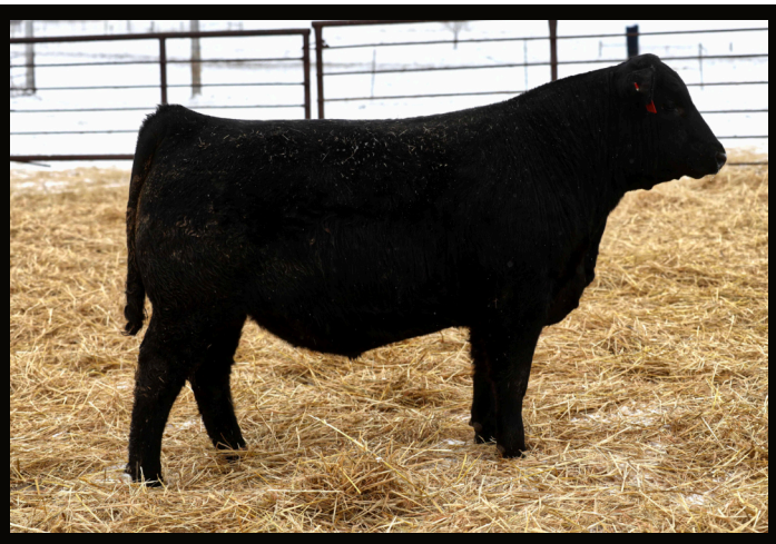
LOT 45: DEAL MADE 532 304L ET